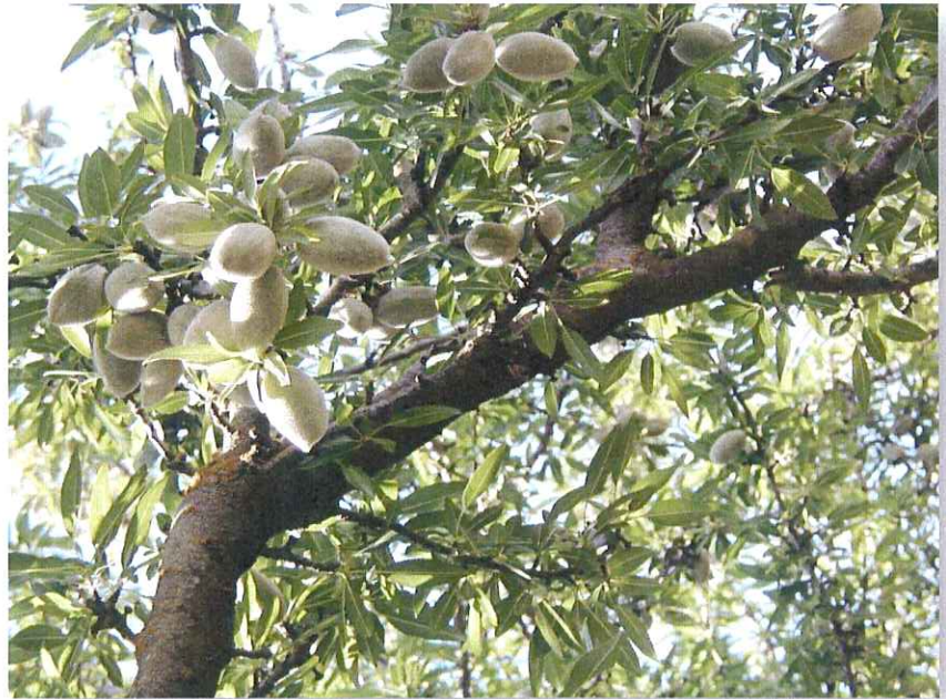
Almond trees on the Beach Farm in Merced County

Both farms – Beach and Silveira -- are located near Livingston in some of the most productive farmland within Merced County. The area consists primarily of farms on parcels typically ranging from 20 acres to over 100 acres in size. The area is especially productive for fruit and nut orchards because of its soil quality, availability of affordable and high quality irrigation water, and proximity to processing and marketing infrastructure. Irrigation is provided by the Merced Irrigation District.