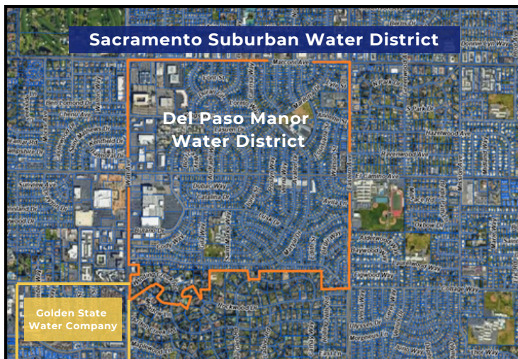
Photo of District Map

While the ratepayers supported the increase in rates, ultimately the amount of funding now available is less than a quarter of what is needed and the cost of service will increase based on the need for improvements.